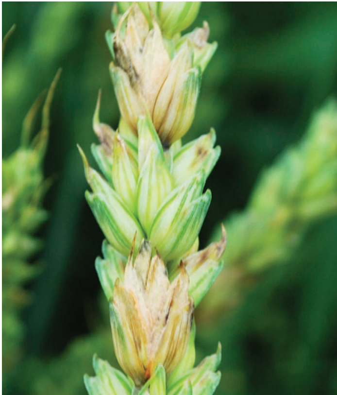
Figure 3. Pink to orange masses of fungal spores may be present on infected spikelets.