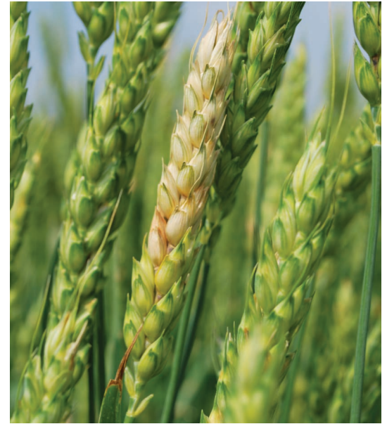
Figure 1. An individual spikelet infected with Fusarium graminearum . During favorable conditions, the fungus may spread into the rachis and infect spikelets above or below the infection point.

When planted, seeds infected with F. graminearum will have poor germination, resulting in slow emergence, and can be