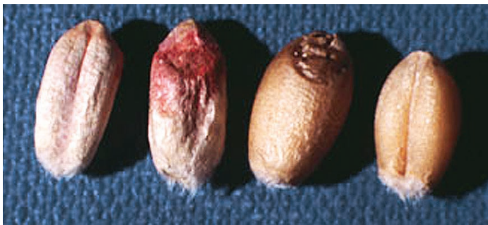
Figure 4. Bleached and shriveled tombstone kernels (left) compared to healthy wheat kernels.

affected by seedling blight disease. Infected seedlings will appear reddish-brown to brown, lack vigor, and tiller poorly.